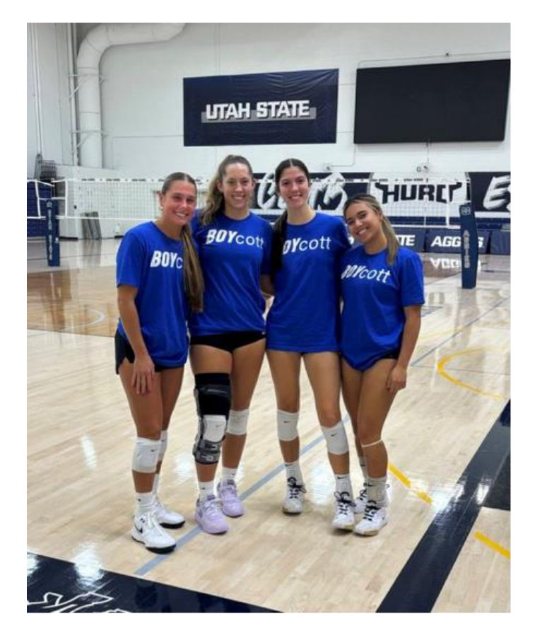
457. On the following Monday the USU Team traveled to Reno, Nevada for their next Mountain West Conference game.

456. Later, the picture was posted on social media and it began to get widespread attention. Here is a true and accurate copy of the picture that was posted: